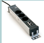
Power socket blocks